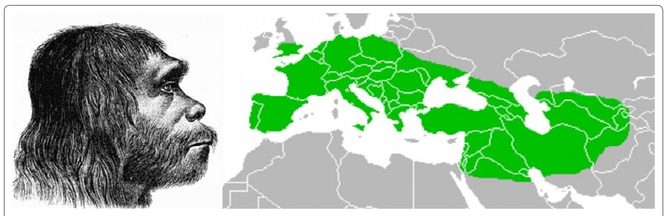
Figure 2. Illustration of a Neandertal man with a map showing the geographical range of Neandertals as currently understood. Neandertals lived across Europe from approximately 400,000 to approximately 30,000 years ago.

initial expansion of anatomically modern humans out of Africa). Developing statistical methods to determine exactly when this gene flow occurred remains an important outstanding task.