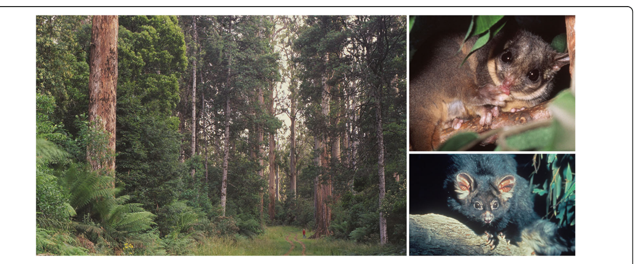
Fig. 2. Stand of large old Mountain Ash trees (photo by Esther Beaton). Top right. Leadbeater's Possum (photo by David Lindenmayer). Bottom right. Greater Glider (photo by David Lindenmayer)