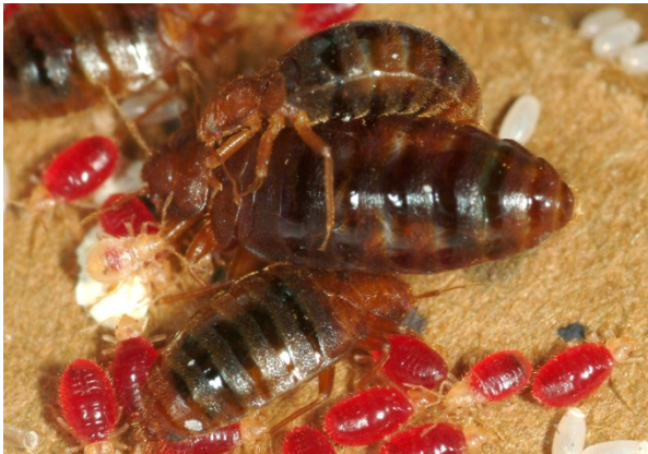
Figure 1. Mating pair (male top) in aggregation of recently fed bed bugs.

gland fluids into her body cavity [6-10]. Sperm must migrate through the haemocoel to the female's reproductive system. The extragenital adaptations seen in females greatly reduce the costs that would be associated with punctures of the cuticle [6]. Even with these modifications, mating is costly, occurring with an excessive frequency that is roughly 20 times that necessary for fertilization of eggs [9]. Each copulation increases risk of infection or physical damage and because nymphs are immature and lack the external and internal adaptations they are at even greater risk.