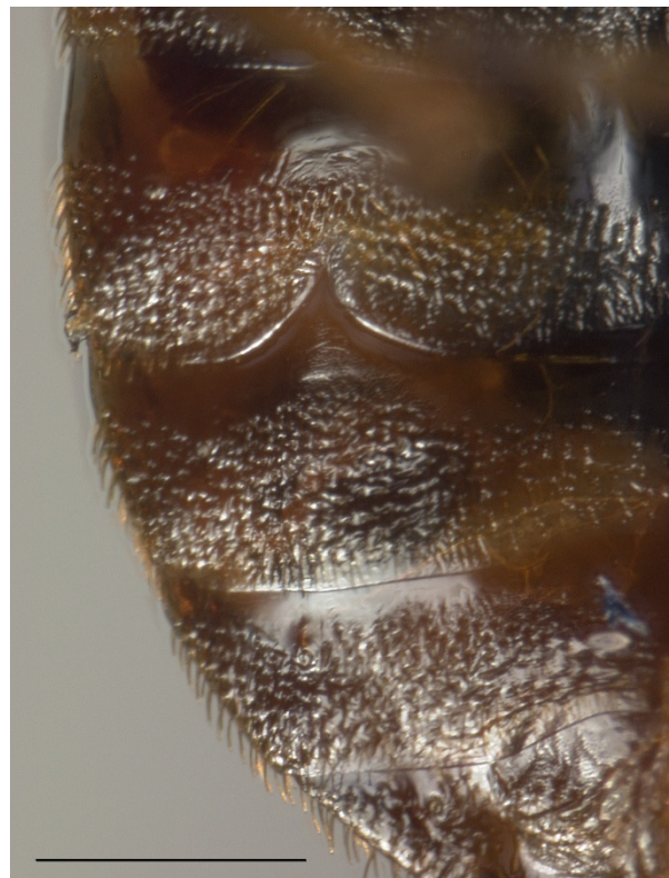
Figure 3. The ectospermalege (inverted V-shape) is an extragenital cuticular structure only on the right side of female. By channelling the male paramere to this part of the abdomen it limits the damage done. Ventral view. Horizontal bar is 5 mm. Internally the female has a mesospermalege that receives sperm and has a presumed function in the immune responses of the female.

its own risks. The evolution of insemination that bypasses the genital system and the subsequent evolution of an