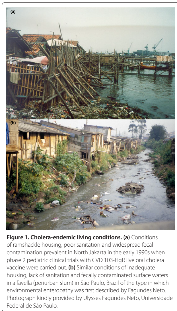
Figure 1. Cholera-endemic living conditions. (a) Conditions of ramshackle housing, poor sanitation and widespread fecal contamination prevalent in North Jakarta in the early 1990s when phase 2 pediatric clinical trials with CVD 103-HgR live oral cholera vaccine were carried out. (b) Similar conditions of inadequate housing, lack of sanitation and fecally contaminated surface waters in a favela (periurban slum) in São Paulo, Brazil of the type in which environmental enteropathy was first described by Fagundes Neto.

small intestine. It is also possible that some individuals may have baseline intestinal immunity not reflected by an elevated serum vibriocidal titer.